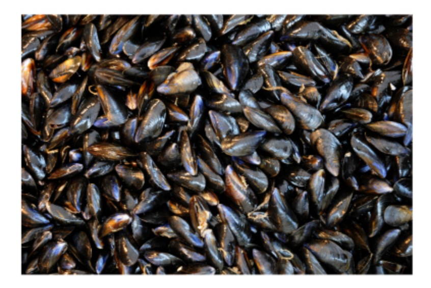
Information about Shellfish Biotoxins