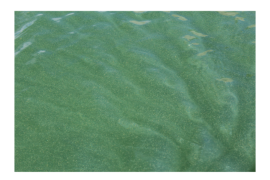
Harmful Algal Blooms