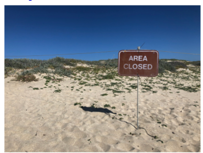
Recreational Shellfish Biotoxin Closures