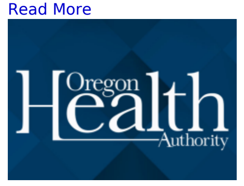
HPV, Oregon Health Authority Read More